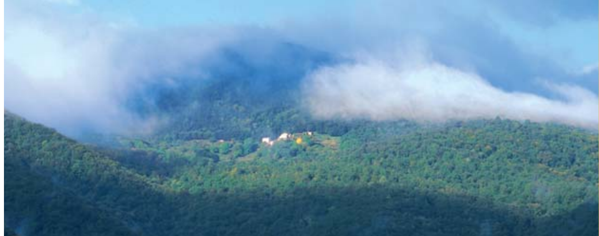
Clouds over La Vall de Bianya after a rain storm