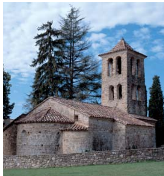
Sant Martí de Capsec

If you decide to visit in mid-February you will also be able to visit the Fira del Farro in La Vall de Bianya , a gastronomical fair with examples of all the most typical culinary features of the comarca .